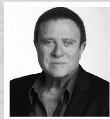
Yehoram Gaon Cinema Sepharad Lifetime Achievement Award