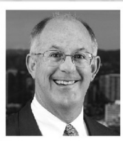
Ronald J. Nessim Maimonides Leadership Award