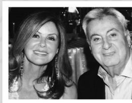
Joelle & Jack Rimokh Sephardic Legacy Award