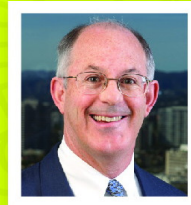
Ronald J. Nessim Maimonides Leadership Award