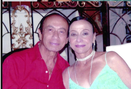
August 19th, 1945 Magen David Synagogue • Calcutta India