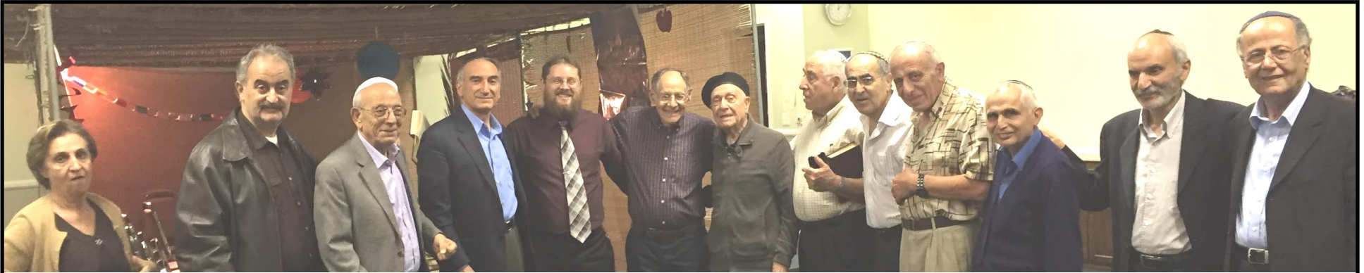
The nighttime learning on Hoshana Rabba was a great success! We had a lovely evening of friendship, food, singing, and selihot in the Sukka together!