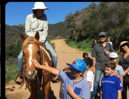
Right Side Hiking up to Inspira- tion point