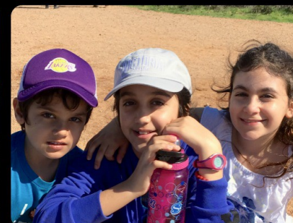
Left Side Sharing a picnic lunch together