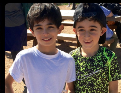
Middle Group pictures, & learning Torah at Inspiration Point