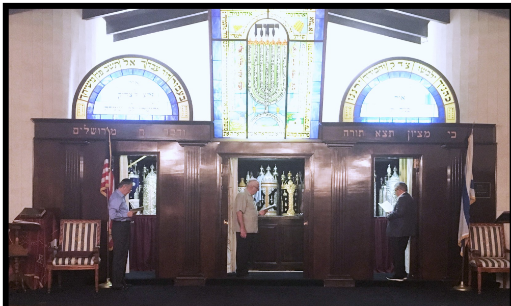
Our sunlit Ekhal on the final morning of Selihot on Erev Yom Kippur