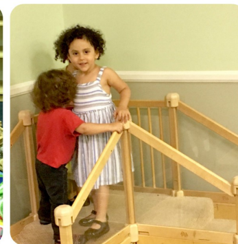
Bottom: Our youngest members and friends enjoying the Kahal playroom outside the sukkah