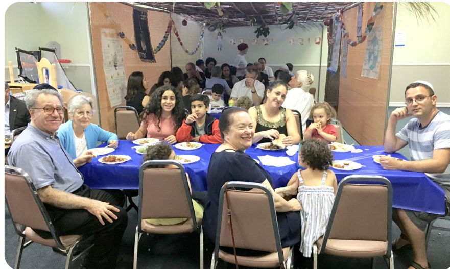
Middle: Group shot and our very full sukkah!