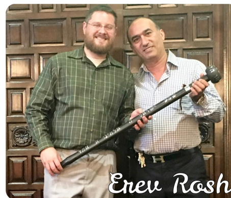
Erev Rosh Hashanah Selihot