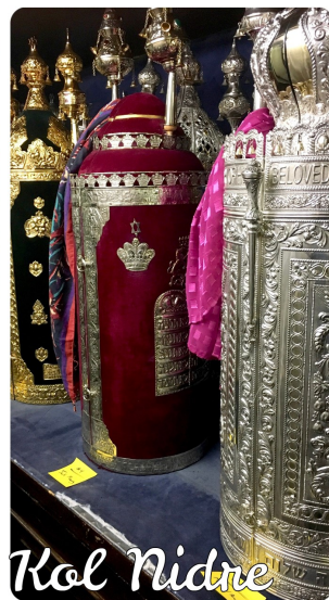
Ready for Kol Nidre