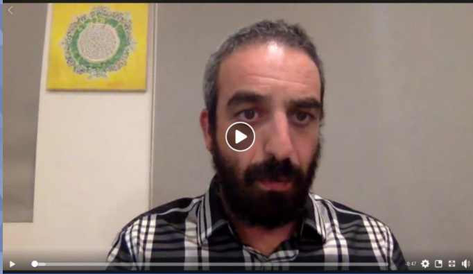
Torah Portion of Ahare Mot