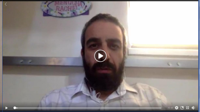
Torah Portion of Kedoshim