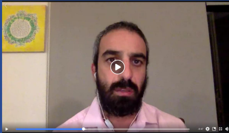
Class on Torah and Hassidut