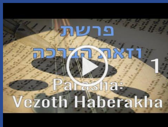
Full Playlist from Hazzan Jalali