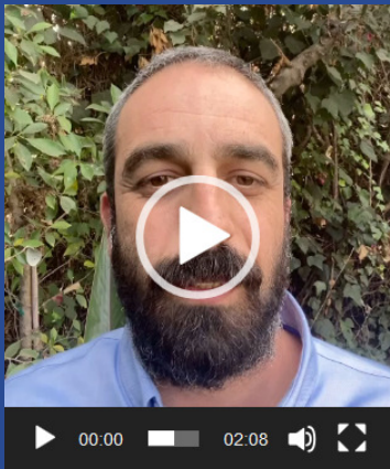
Rabbi's Shabbat Message