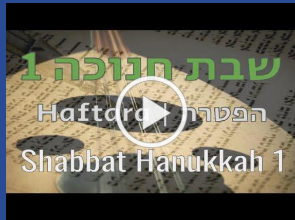
Haftara, Shabbat Hannukah 1