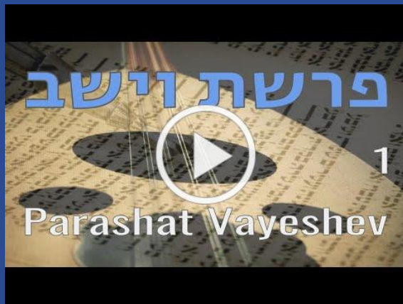
Vayeshev, Aliya 1