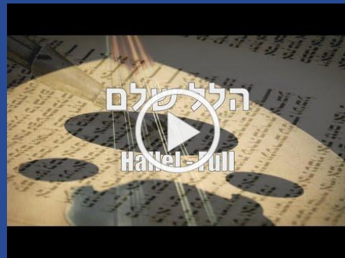
Full Hallel, read each day of Hannukah