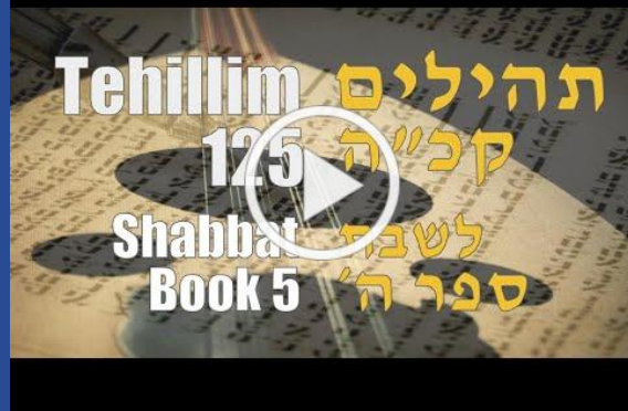
Tehillim 125, Hazzan Saeed Jalali