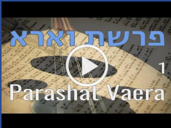
Vaera 1, Hazzan Saeed Jalali