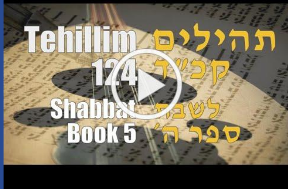
Tehillim 124, Hazzan Saeed Jalali