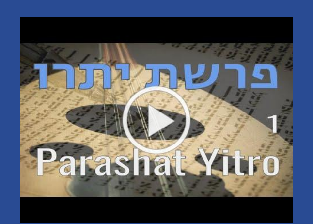
Yitro 1, Hazzan Saeed Jalali