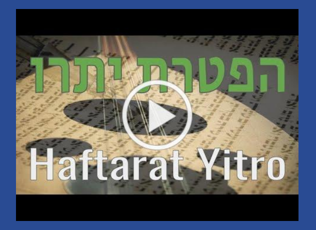
Haftara for Yitro