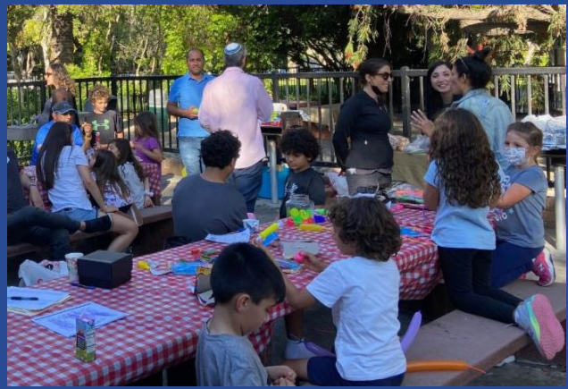
Families enjoy picnicking with the KJ community.