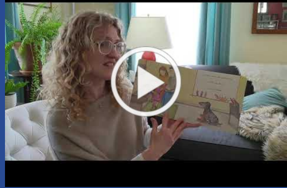
Aish Coloring Book