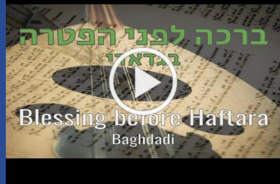
Blessing before Haftara, Hazzan Jalali 2021