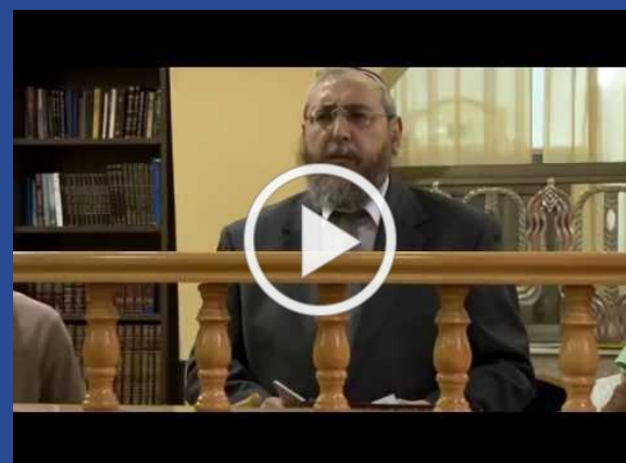
Selihot in Israel, 2012

KJ Family Shabbat & High Holy Day Learning