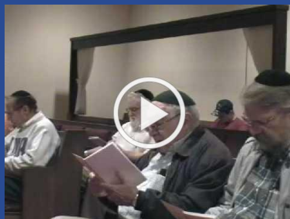
Selihat at Ezra Bessaroth, Seattle