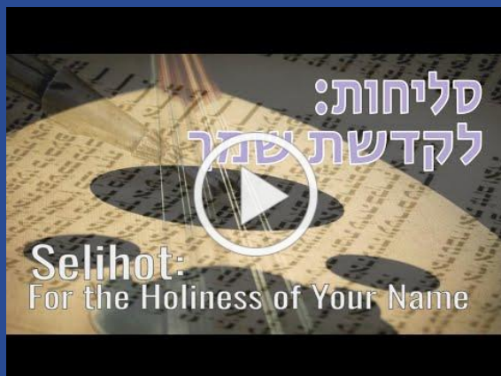
Selihat--L'kdushat Shmecha, Hazzan Jalali 2020