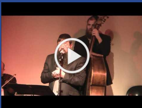
Melekh Goel U'Moshia, Israel