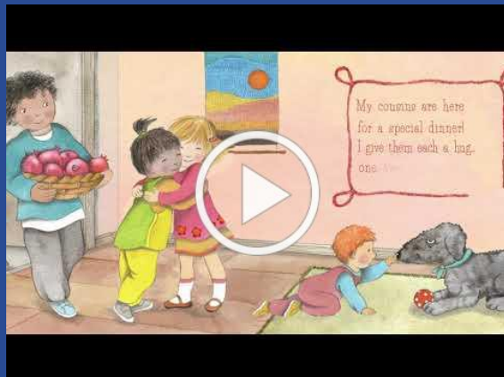
Rabbi Sacks Parasha