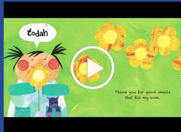
Chabad Kids Parasha