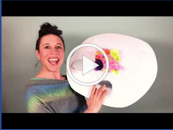
Rabbi Sacks Parasha