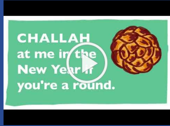
Chabad Kids Parasha