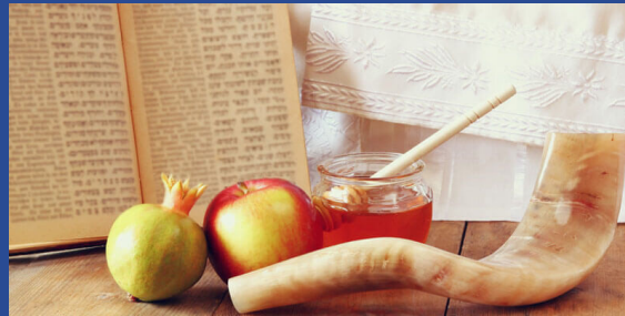
Aish Coloring Book