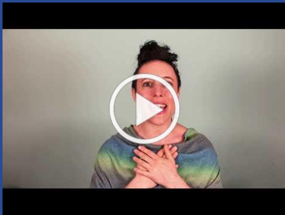
Rabbi Sacks Family Parasha