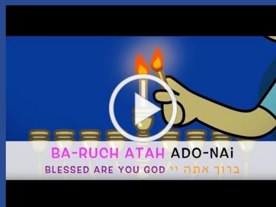
Parasha Vayetse Coloring Pages