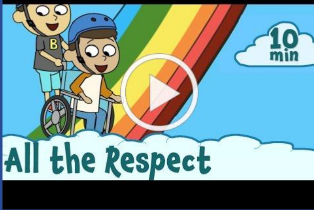
Rabbi Sacks Family Parasha