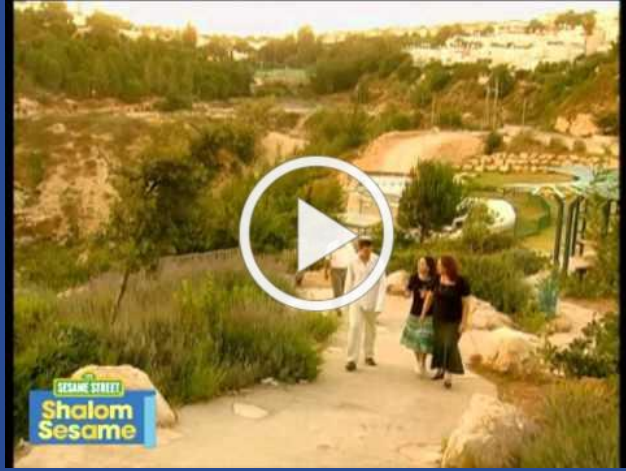
Chabad Kids' Parasha